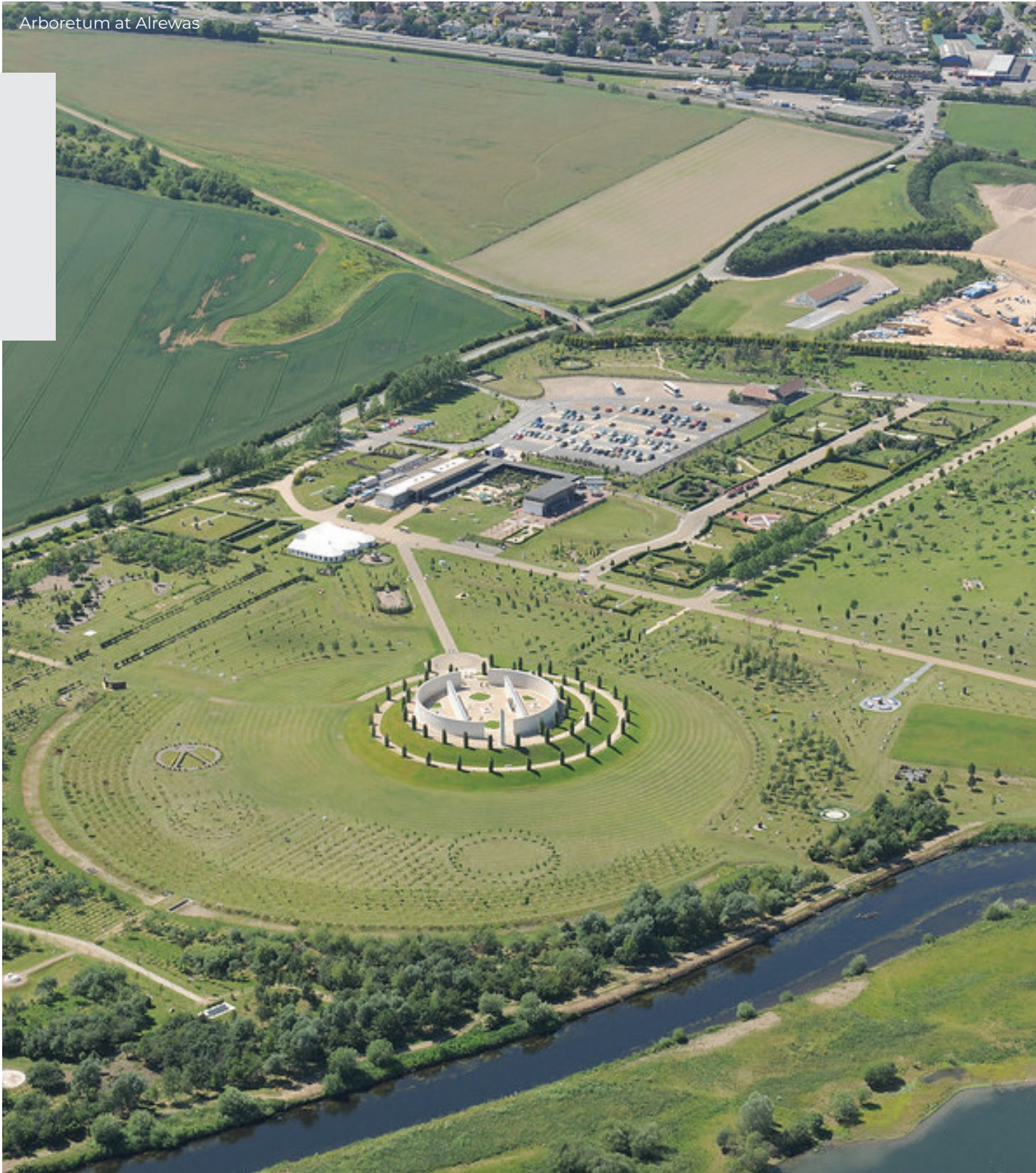
Arboretum at Alrewas

Fairfields is close to main motorway, rail and air transport links, which is one of the key reasons why Burton-on-Trent is popular for those who need to commute; with the A38 and A50 linking to the M6, A42, M42 and M1 all nearby. Burton-on-Trent is approximately two miles away, with Derby, Stafford, Cannock, Uttoxeter, Birmingham, Nottingham, Leicester, Lichfield, Loughborough, Walsall, and Wolverhampton all within easy reach. Burton-on-Trent railway station is only a short 3-mile drive away and East Midlands and Birmingham International Airports are within a 45-minute drive.*