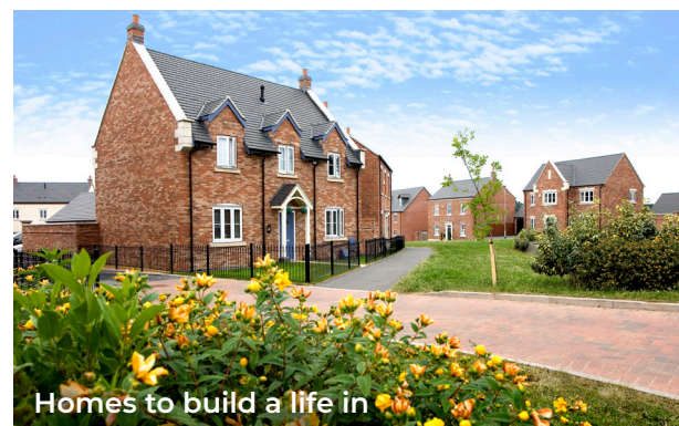
Homes to build a life in

At Peveril Homes, we genuinely care about the homes we build, the communities we create, the partners and suppliers we work with and our customers. Whether we're building a one bedroom apartment or five bedroom house, our commitment to the quality of build and the journey our customers take with us is the same.